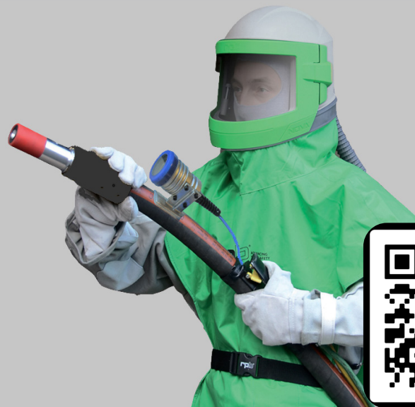
SAMPLE CONFIGURATION: 630531B1 HOSE MOUNT, POWER CORD WITH CONNECTOR